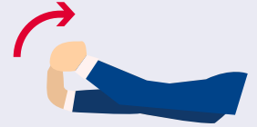
(stretch into extension)

Extend your arm in front of you with your palm facing the floor. Gently pull your fingers down and back with your other hand and hold for up to 30 seconds. Repeat this with your palm facing the ceiling and gently pull your fingers up and back. Hold for up to 30 seconds and then switch arms.