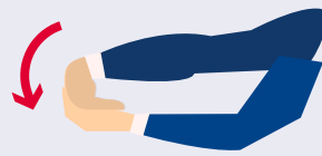
(stretch into flexion)